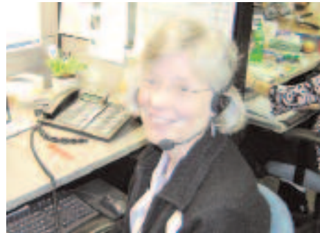
CUTCO customer service

We care for our customers in many ways, including in-home service calls by independent sales representatives who offer sharpening and other services, as well as our skilled customer service representatives at our headquarters. The CUTCO ideal of stellar customer service is contained in our Forever Guarantee, which, among many features, provides for free sharp-